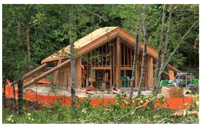
View of the Fiber Arts Studio northeast façade from the Carving Studio, August 30, 2017.